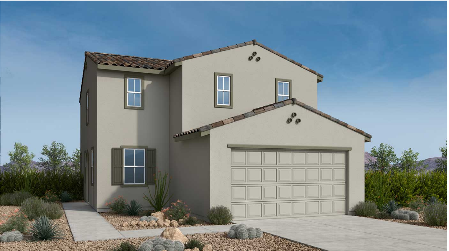
Elevation A - Santa Barbara