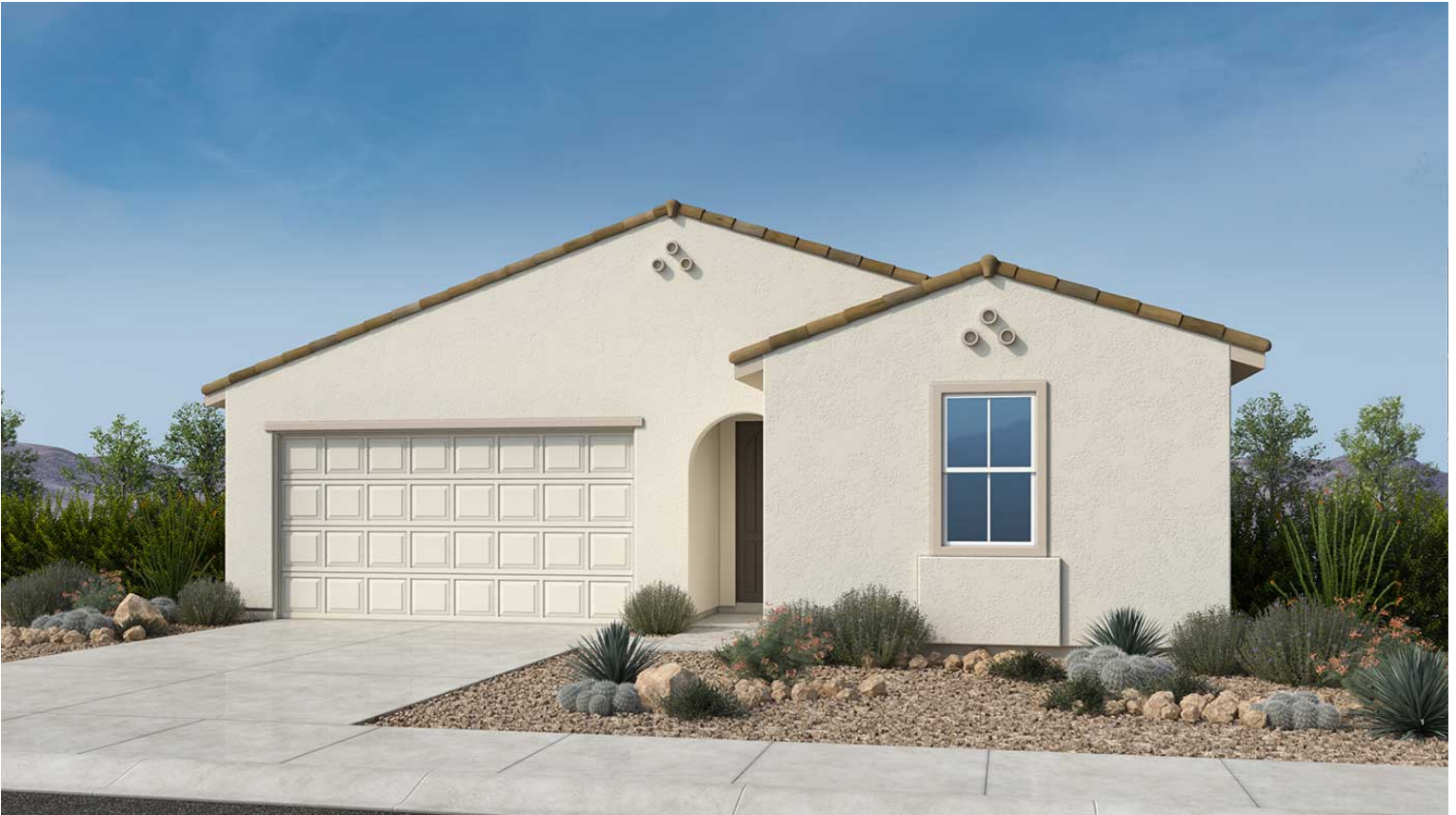
Elevation A - Santa Barbara