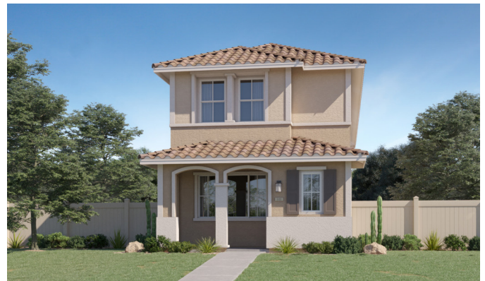
Elevation G | Italianate