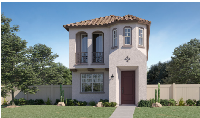
Elevation A | Spanish