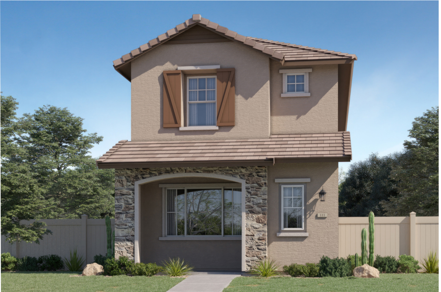
Elevation F | French Country